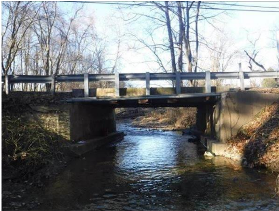
Boggs Road Bridge

BEL AIR, Md., (July 18, 2019) - The Boggs Road Bridge, located between High Point Road and Grafton Shop Road in Forest Hill, reopened earlier today to all traffic. Harford County Department of Public Works – Bureau of Construction Inspections closed the bridge on July 9 for a cleaning and painting project. The project was expected to take four weeks, but was completed ahead of schedule.