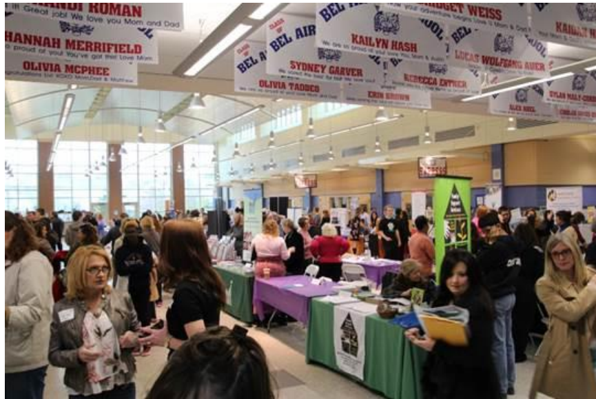
Photo caption: Attendees find resources at Harford County's Expo for Transitioning Youth held on April 7 at Bel Air High School