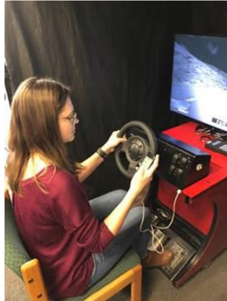
Harford County public high school students behind the wheel of Save A Life simulators showing the impact of distracted and impaired driving.