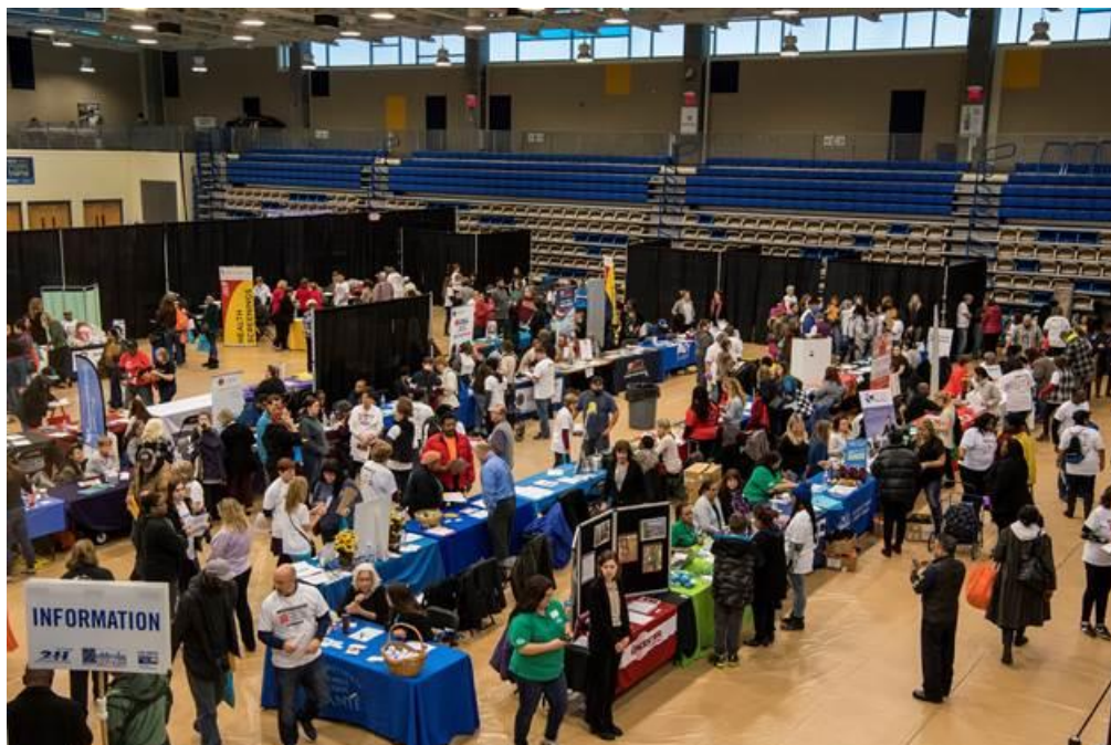
Project Homeless Connect at Harford Community College's APGFCU Arena