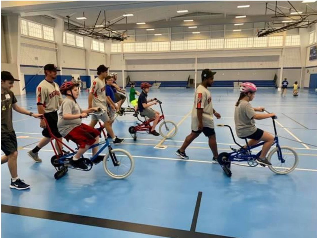
Participants and volunteers in Harford County’s 2019 iCan Bike summer camp.