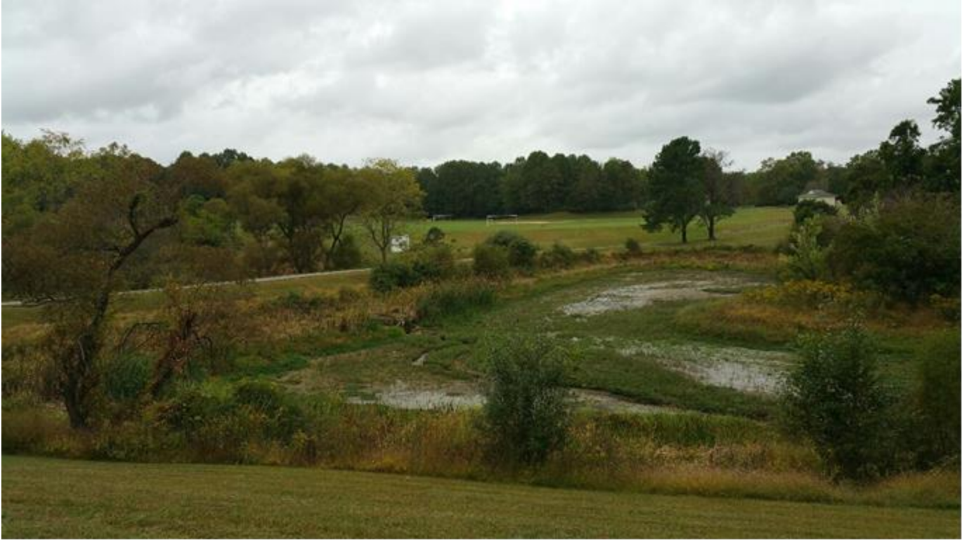
Site of the planned watershed protection and restoration project at Heavenly Waters Park in Bel Air