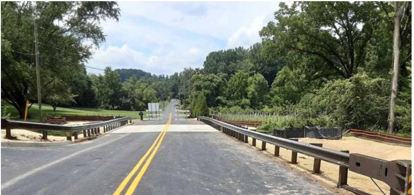
Chestnut Hill Road bridge over Stout Bottle Branch

Over the next few days, weather permitting, single lane closures may be necessary at times for the contractor to complete minor work, but the bridge will remain passable.