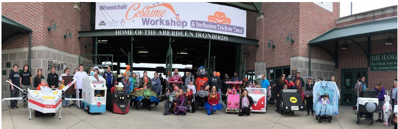
2019 Wheelchair Costume Workshop participants and volunteers

More information about opportunities for citizens with differing abilities is on the Harford County website, www.harfordcountymd.gov .