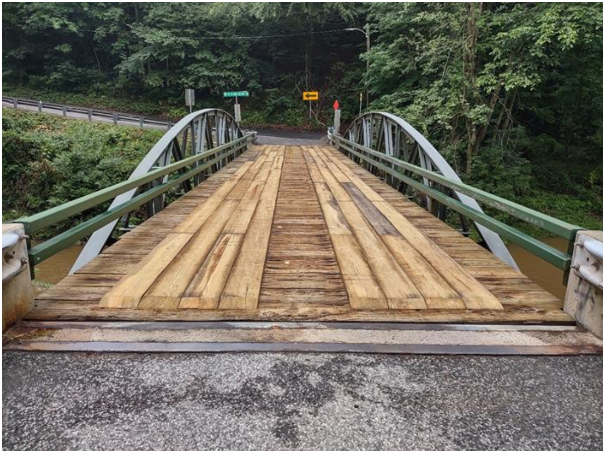
Completed repairs to Ring Factory/Whitaker Mill Road Bridge in South Bel Air

Questions about this project may be directed to Naveed Shah, Department of Public Works at 410-638-3509 extension 1395.