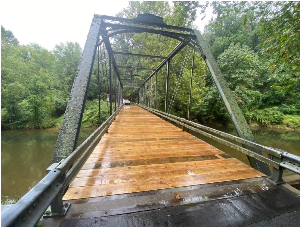
The timber has been replaced on the Cherry Hill Road bridge, which has reopened.