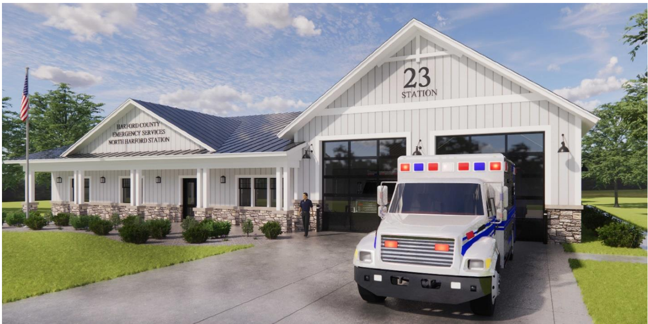
Architectural rendering of the future Harford County Emergency Services North Harford Station