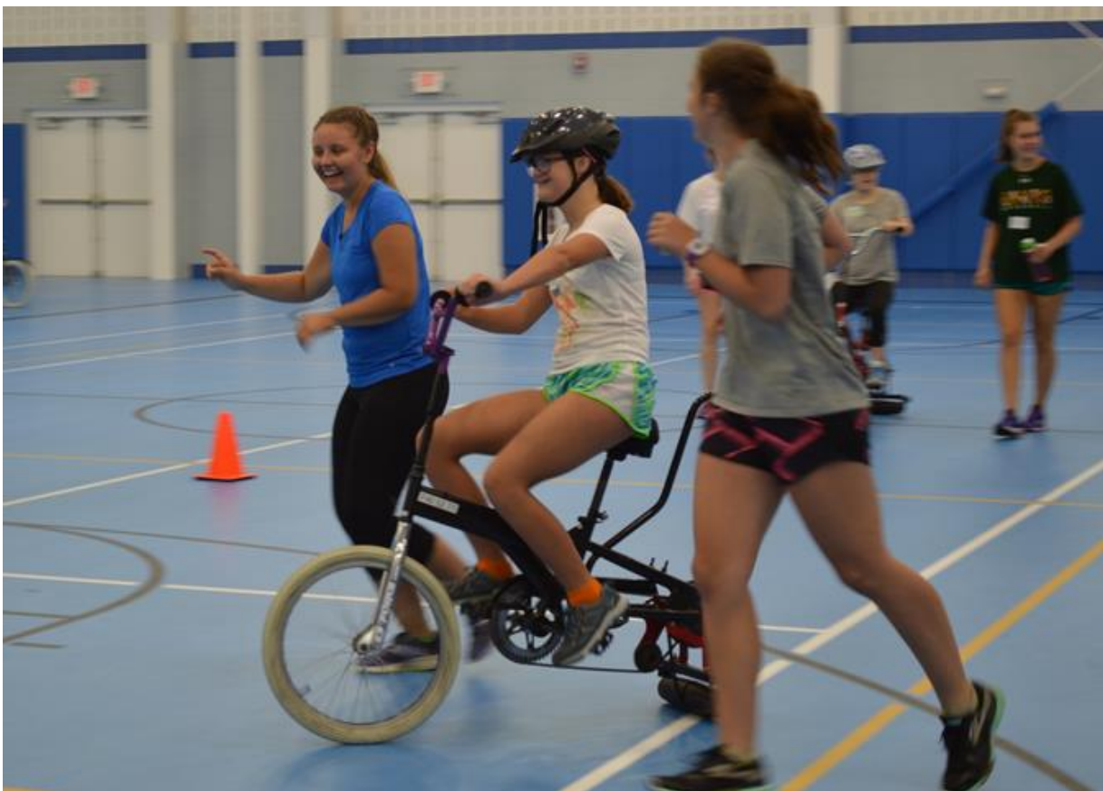
Volunteers assist campers as they experience the joy of learning to ride a bike at Harford County’s 2018 bike camp for individuals with disabilities.