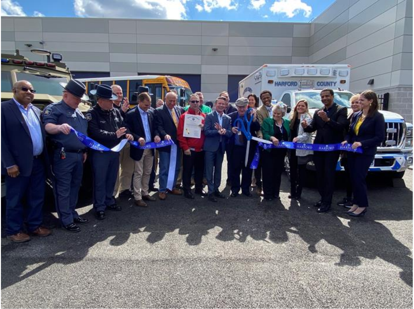
Harford County officials cut the ribbon on a new joint-use facility in Bel Air to maintain county government and public school vehicles.