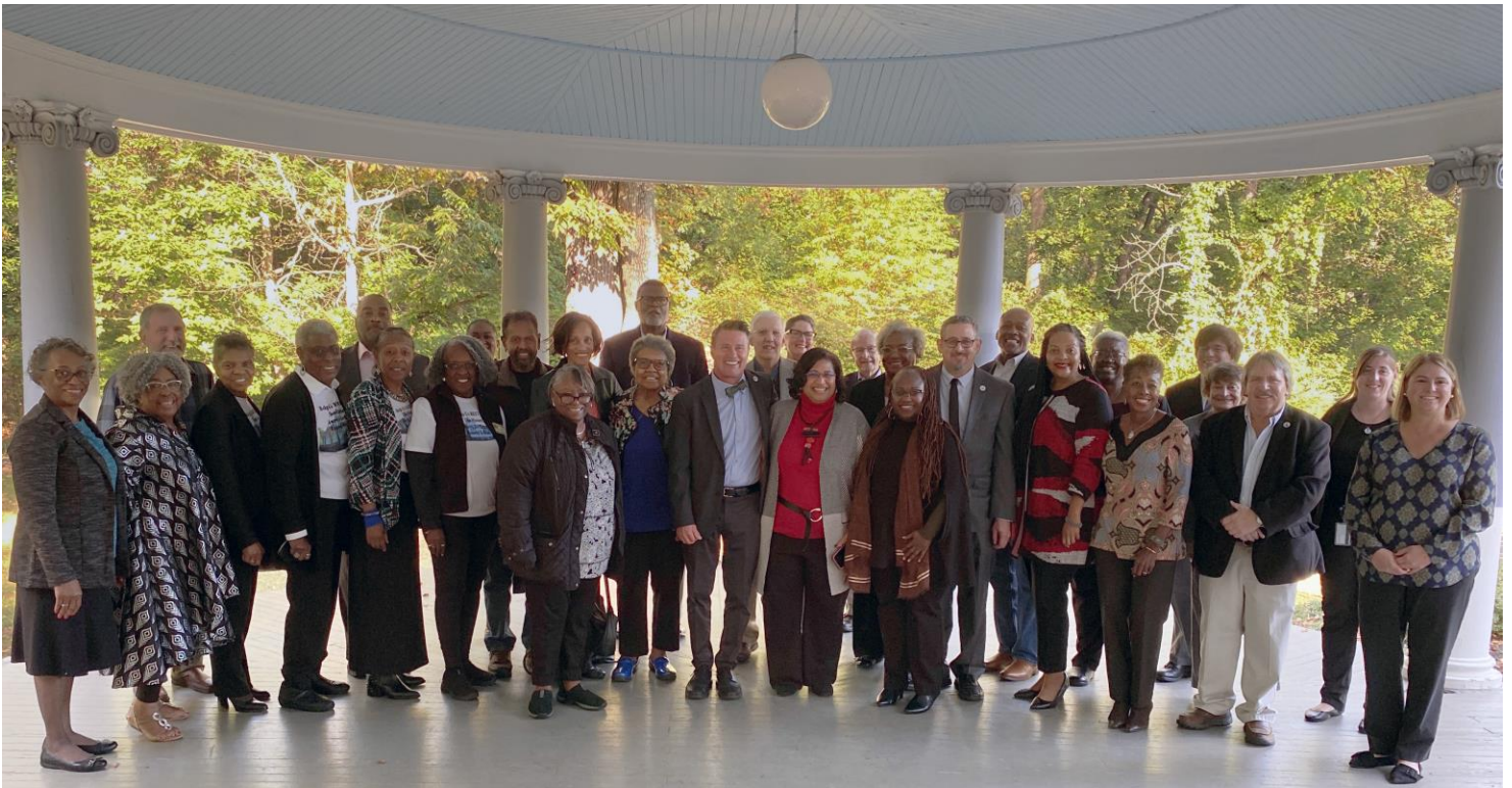
Attendees at the award announcements in Bel Air for Harford's inaugural African American Heritage Grants.

as quarters for persons enslaved on the farm. This project will grow the body of knowledge on enslavement in Harford County and at Woodview, culminating in a public presentation of the findings and the potential for future historical interpretation on the property.