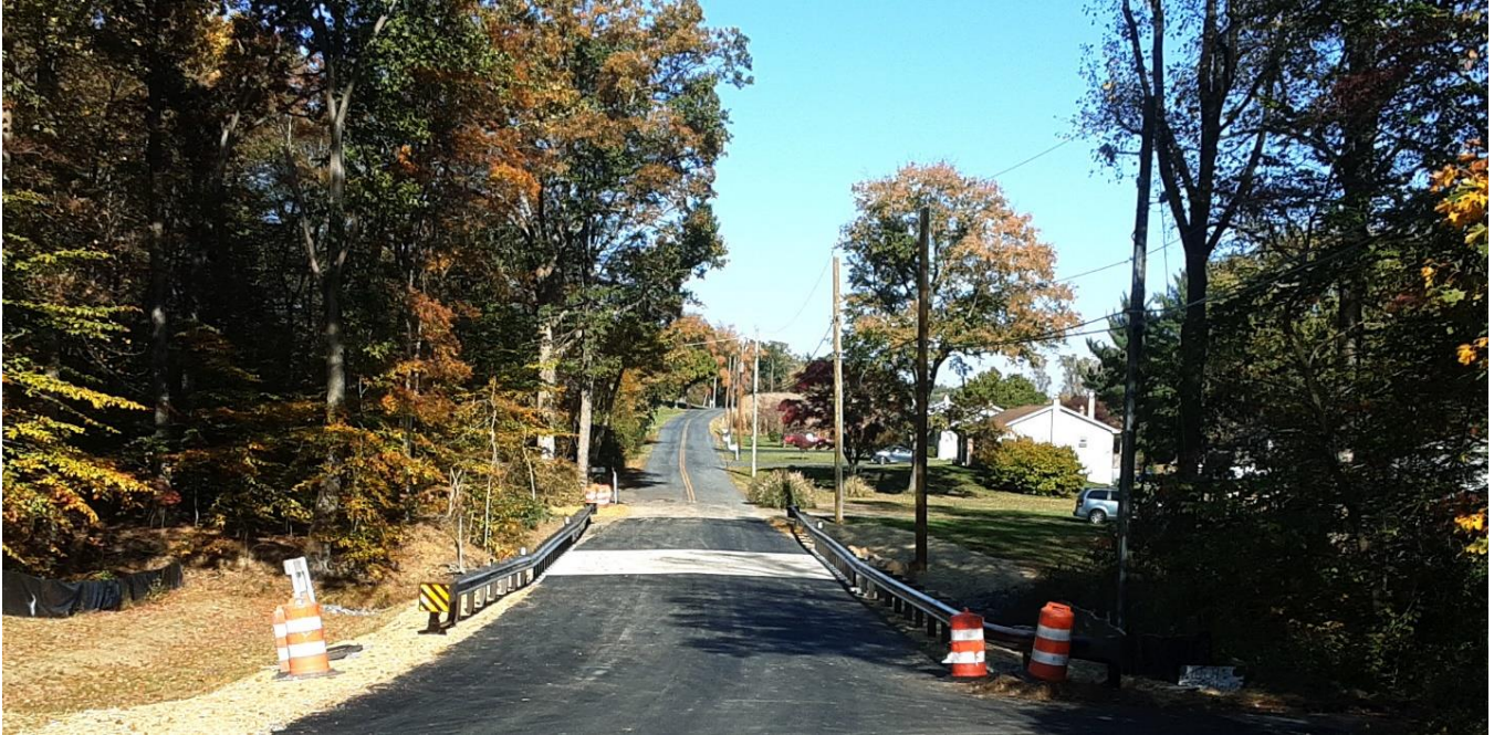
Glen Cove Road in Darlington, between Dublin Road and Franklin Church Road, has reopened to all through traffic following replacement of the bridge over Peddler Run.