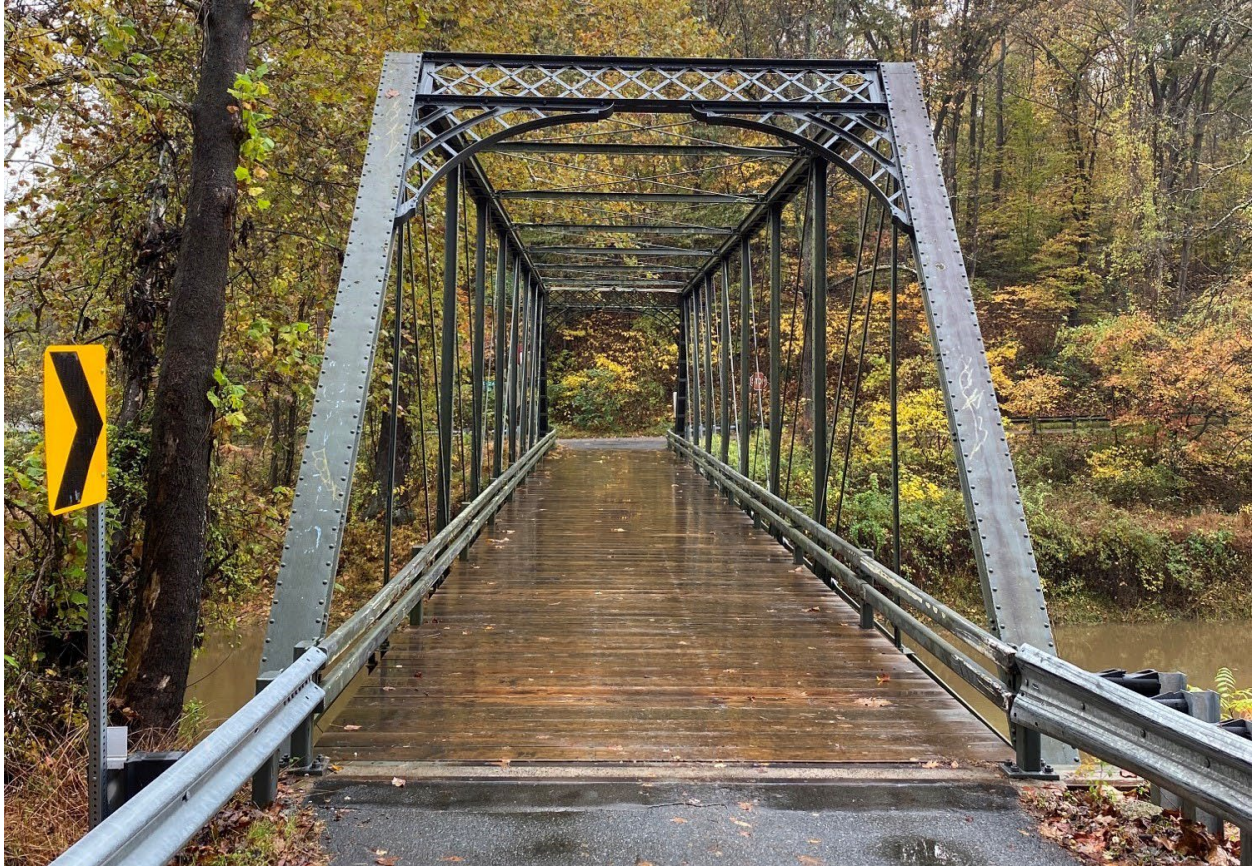
Cherry Hill Road is reopened after emergency repairs to the bridge over Deer Creek.