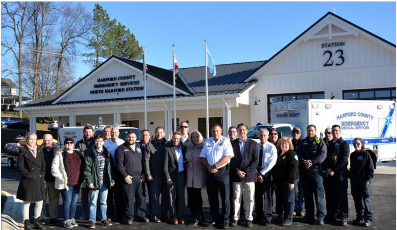
County officials dedicating the Harford County Emergency Services North Harford Station on Pylesville Road.

Because northern Harford County is rural and mainly without hydrants, the station has an underground, 30,000-gallon water tank to serve local volunteer fire companies.