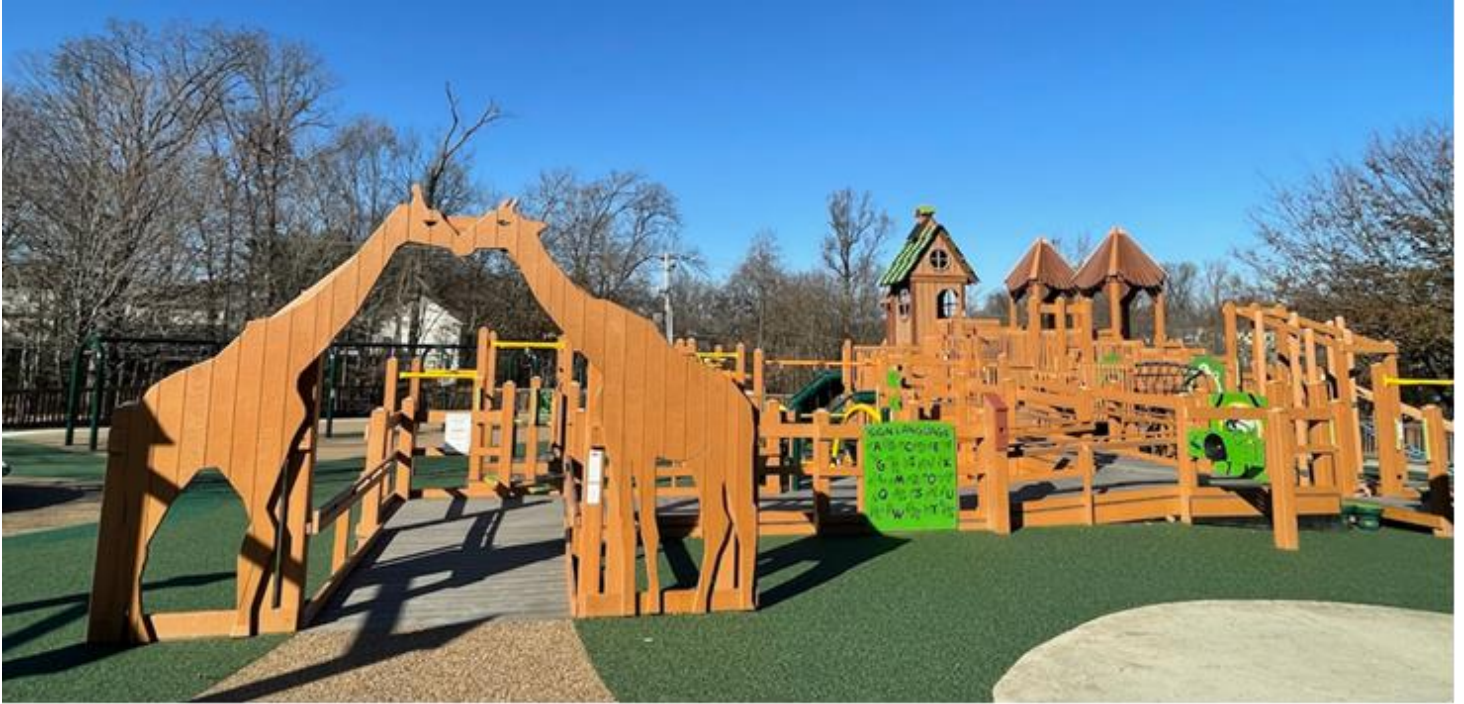
The 5-to-12-year-old section of Lyn Stacie Getz Creative Playground in Bel Air is open with new equipment and more accessible surface.

only remaining playground work is on the see-saw in the toddler section and it is scheduled to be finished in the next couple weeks.