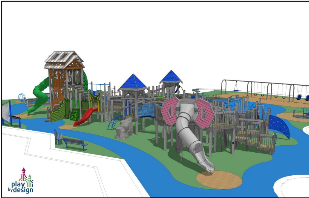
Rendering of Annie's Playground renovations, 5-12 year-olds section