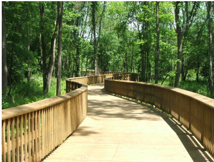
Example of boardwalk to be repaired on Ma & Pa Trail – Edgeley Grove section