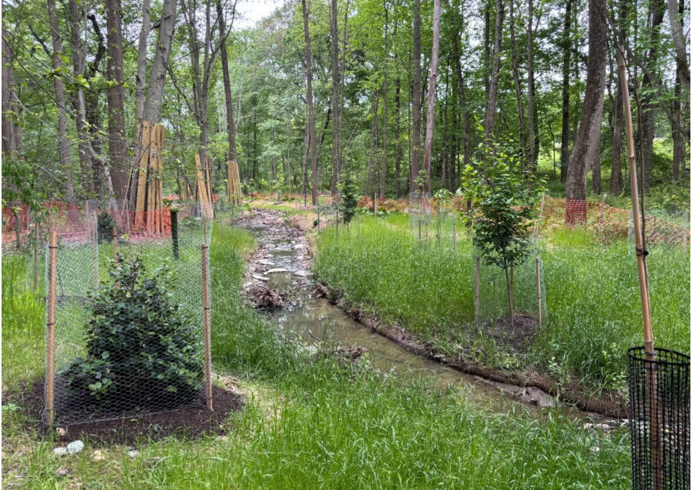
Photo caption: Following completion of the in-stream construction, crews installed 2,500 live tree stakes along the stream banks and planted more than 1,400 trees and shrubs to establish and enhance the vital riparian buffer along the stream.