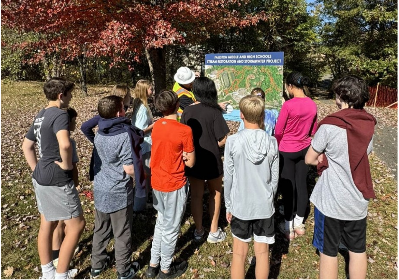
Photo caption: The restored area will serve as a living classroom, offering students hands-on learning opportunities in stream ecology and conservation in their own backyard.