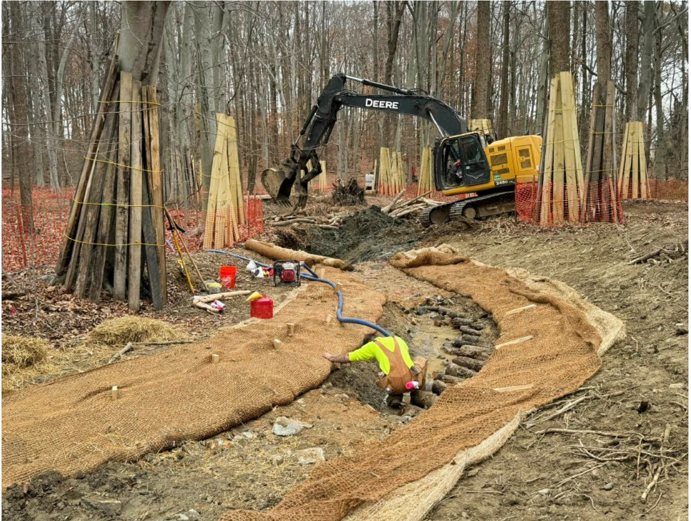
Photo caption: Harford County has completed a major stream restoration and stormwater management project at Fallston Middle and High Schools, restoring more than 5,000 feet of stream on the campus.