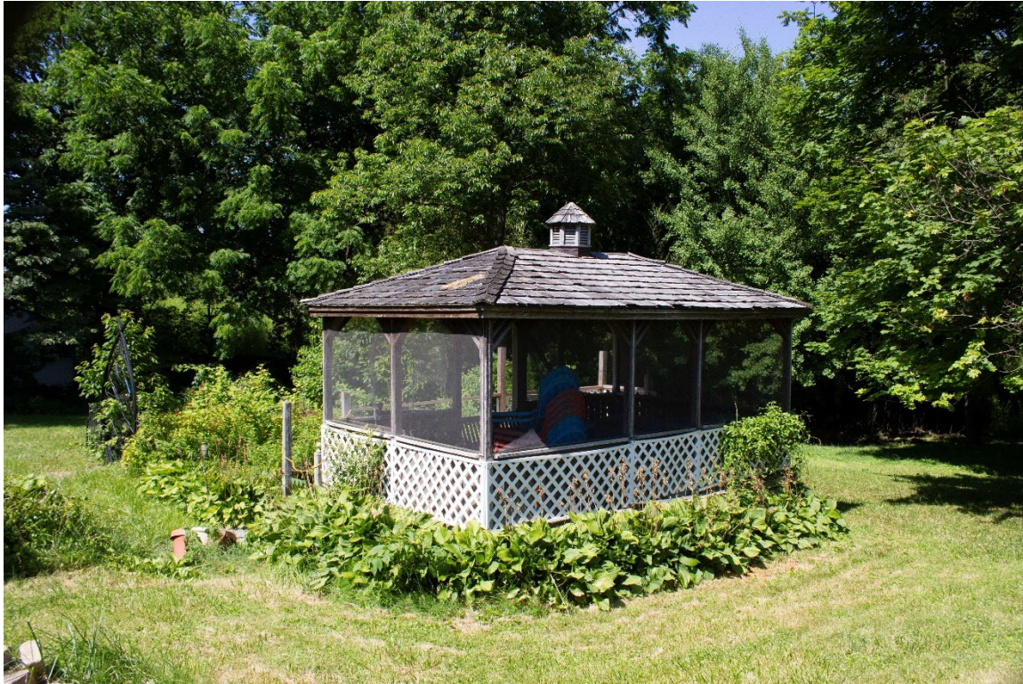
Figure 5. Gazebo, west and south elevations