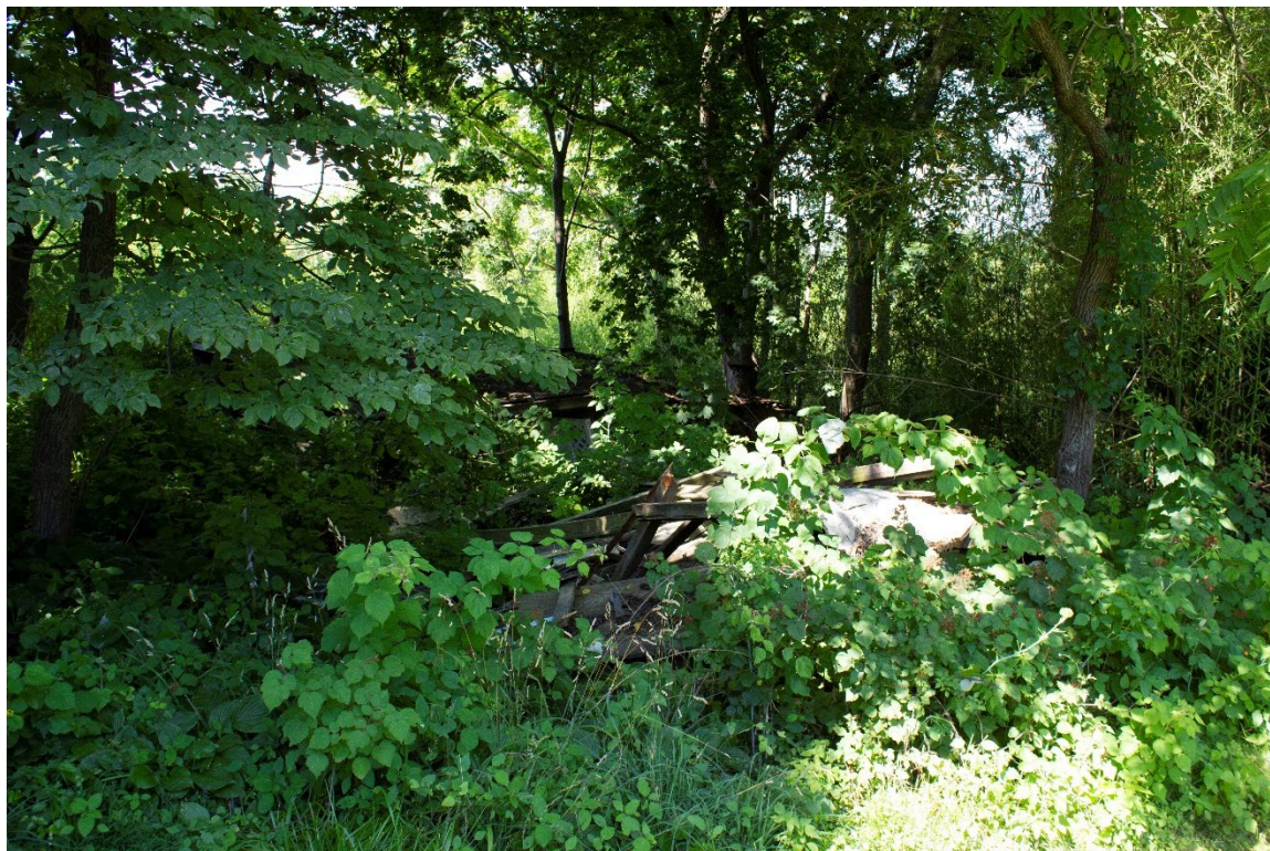
Figure 9. Unknown ruins, facing north