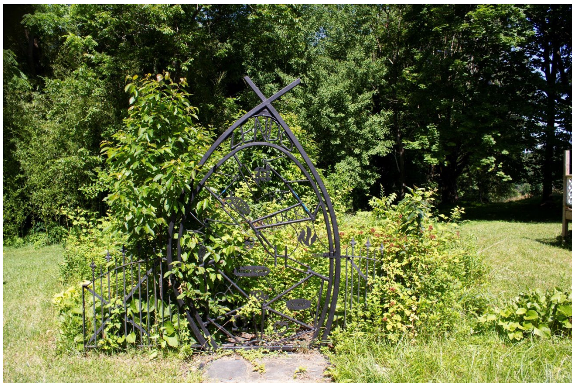
Figure 10. Garden, west gate