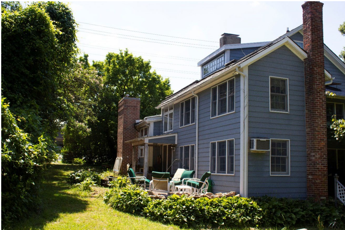
Figure 2. South and east elevation