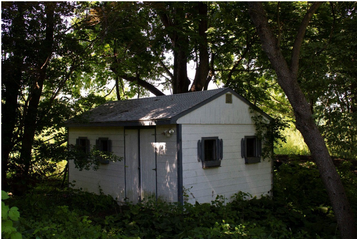
Figure 6. Shed (Outbuilding 1), east and south elevations