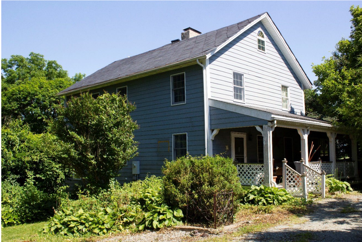
Figure 1. Facade and north elevation