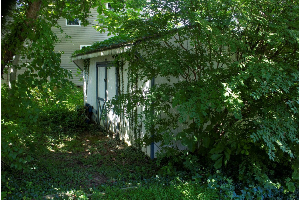
Figure 7. Shed (Outbuilding 2), west and south elevations