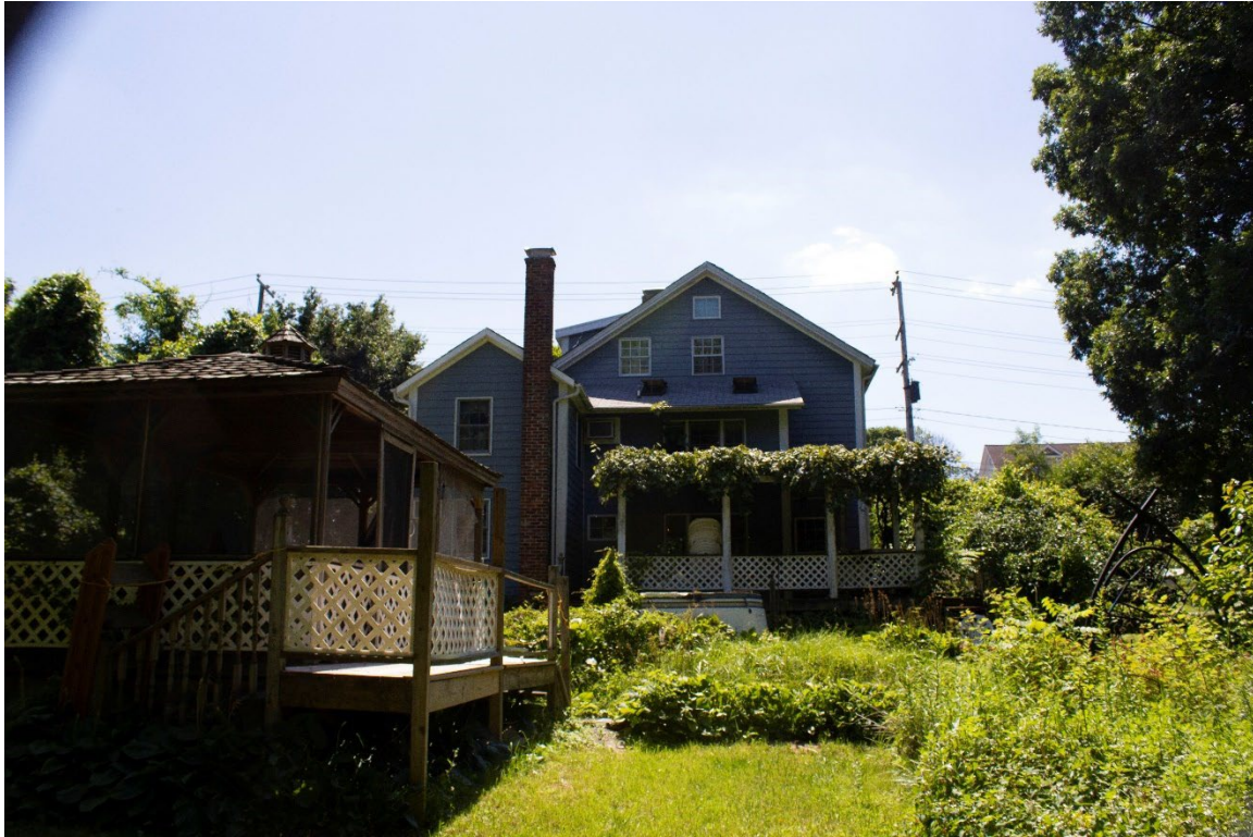
Figure 3. East elevation and gazebo