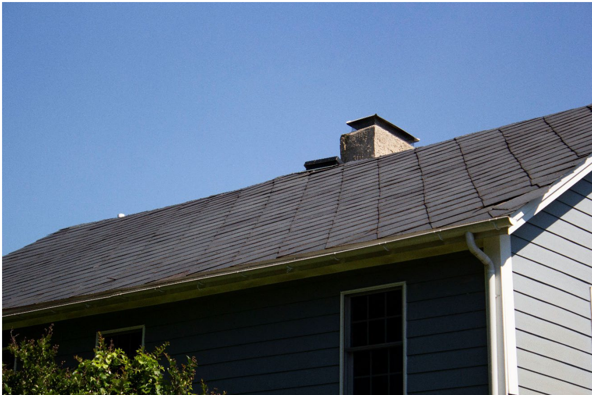
Figure 4. Detailing of German-style slate roof tiles