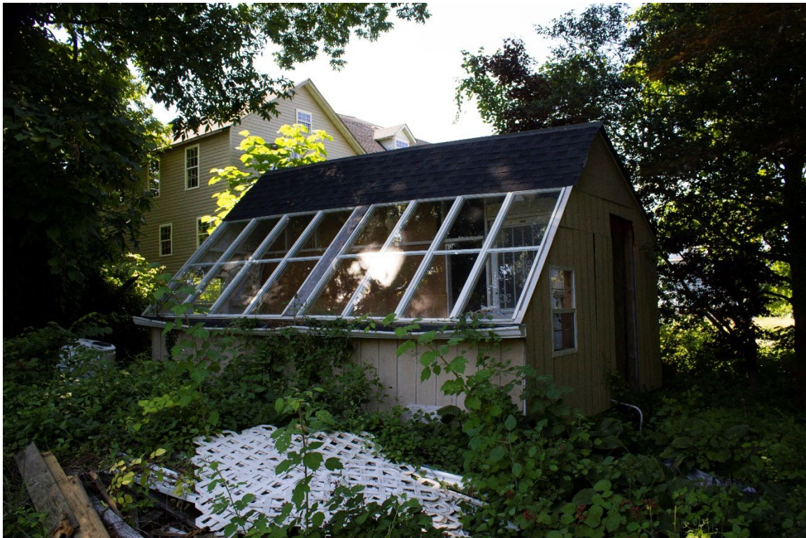
Figure 8. Greenhouse, south and east elevations