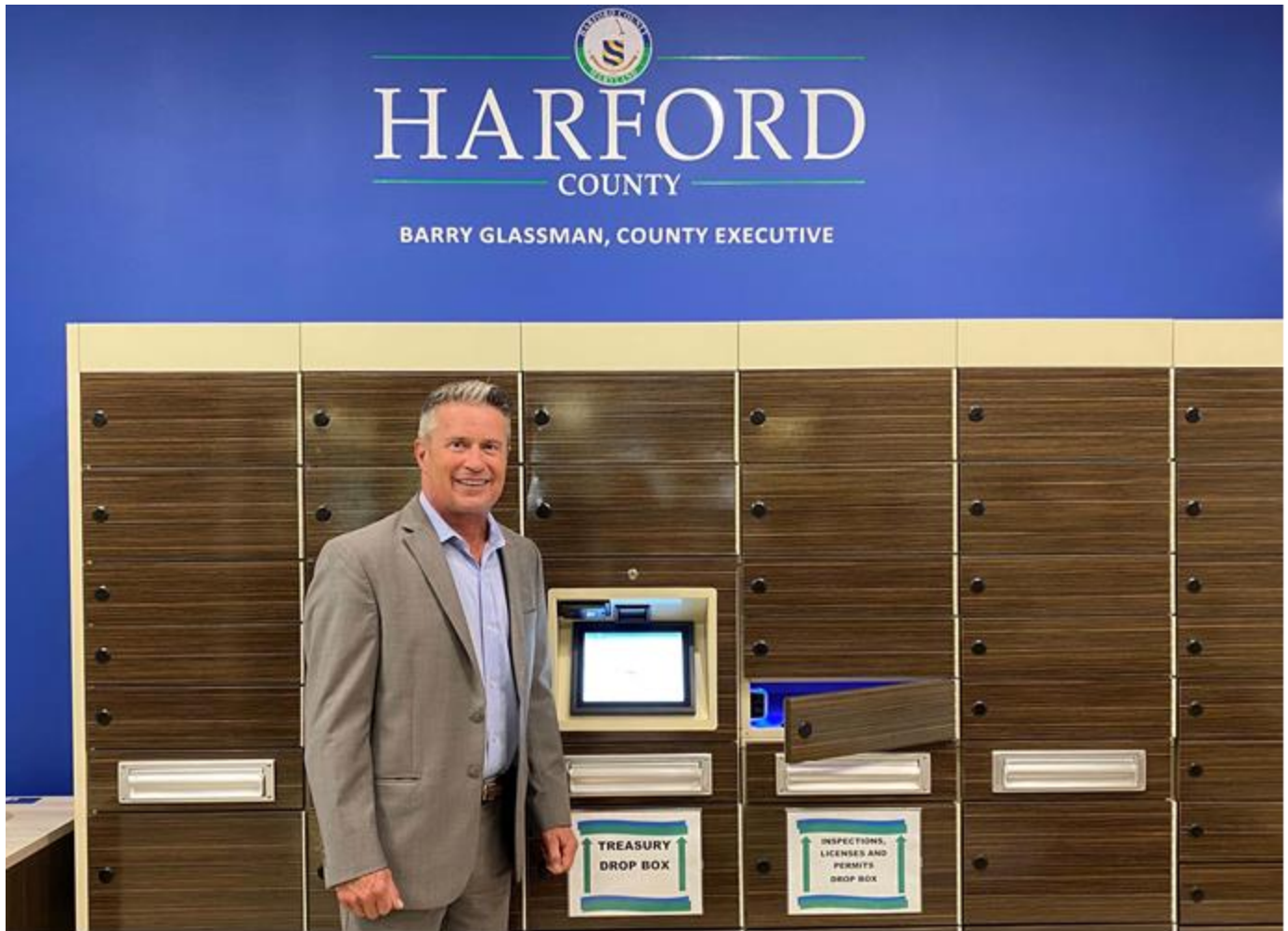
Harford County Executive Barry Glassman demonstrating the smart locker system for document exchanges at the county office building in Bel Air.