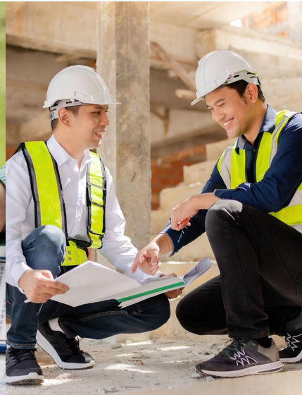
COMMUNITY DEVELOPMENT & AFFORDABLE HOUSING