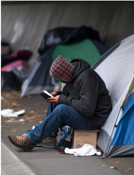
FUNDING FOR HOMELESS SERVICE PROVIDERS